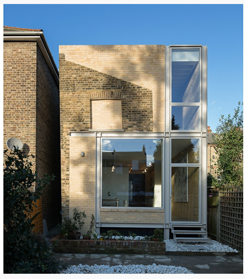
House of Trace