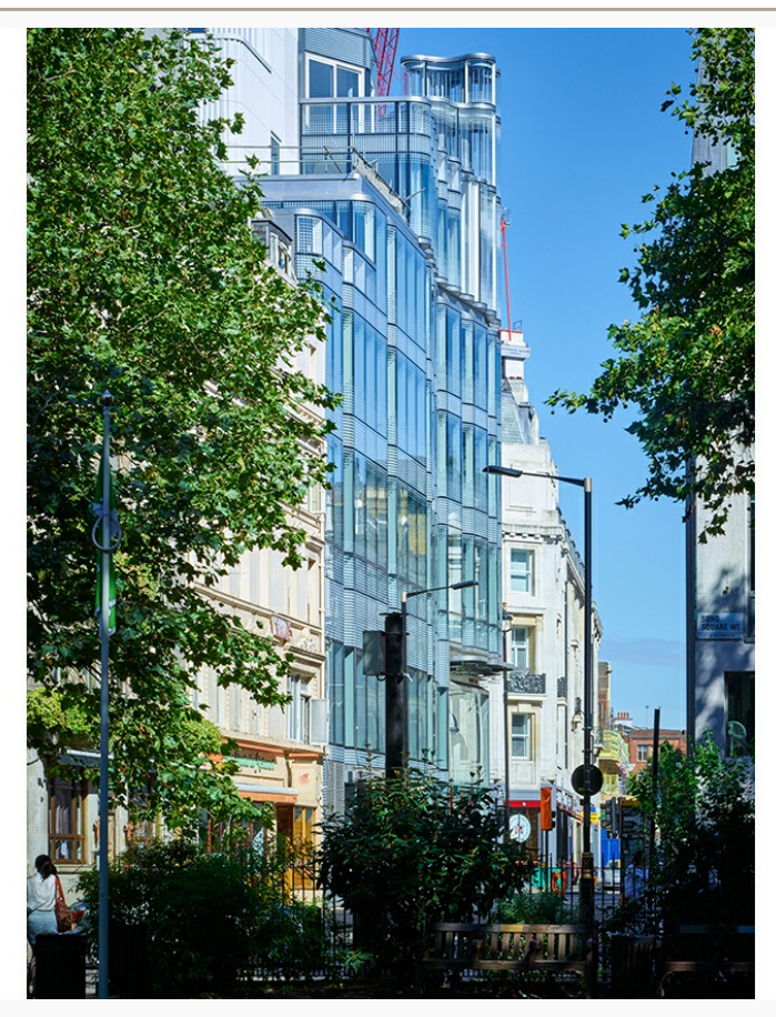
61 Oxford Street