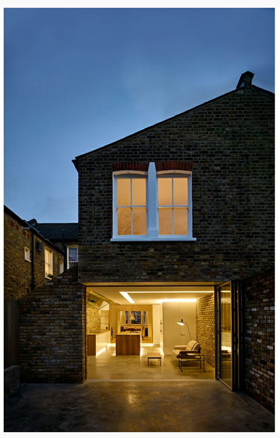
Modern Side Extension